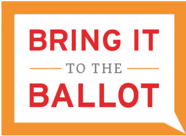
PHOTO ID REQUIRED STARTING IN 2016

These are acceptable for voting purposes, and can be unexpired or expired after the date of the most recent general election: